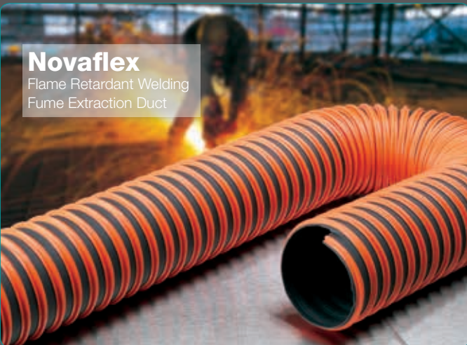
Novaflex Flame Retardant Welding Fume Extraction Duct

The Novaflex Group ® is a market leader through excellence in product innovation and design. The Novaflex Group ® is a privately held company committed to the continuous advancement in hose and connector solutions. Novaflex has one of the broadest product ranges available in the hose and ducting marketplace, as well as HVAC and Industrial Venting, Hose Industries and Commercial Exhaust Venting Systems. Products are sold in industries across North America and around the world.